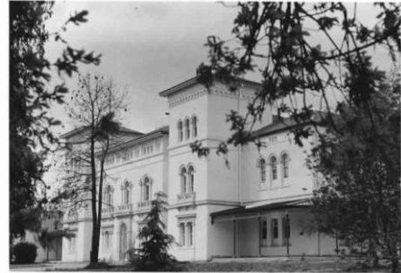
Beechworth Mental Hospital - 1950