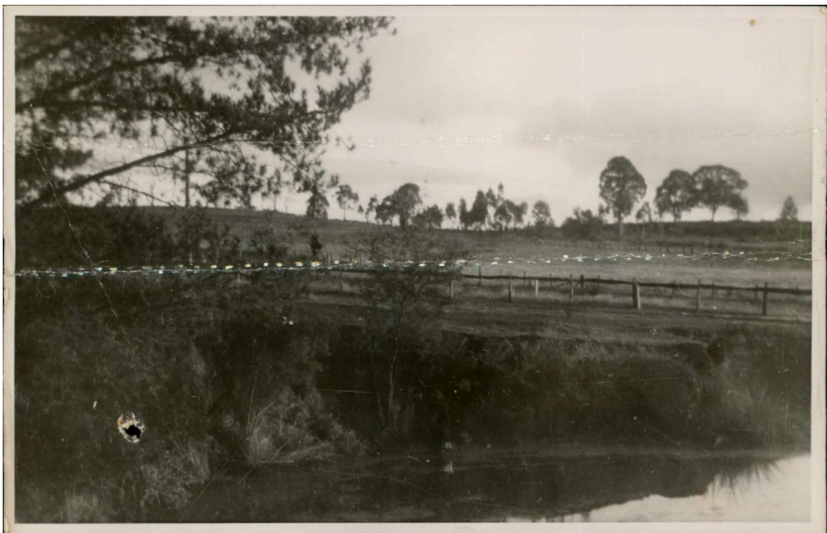
July 1955